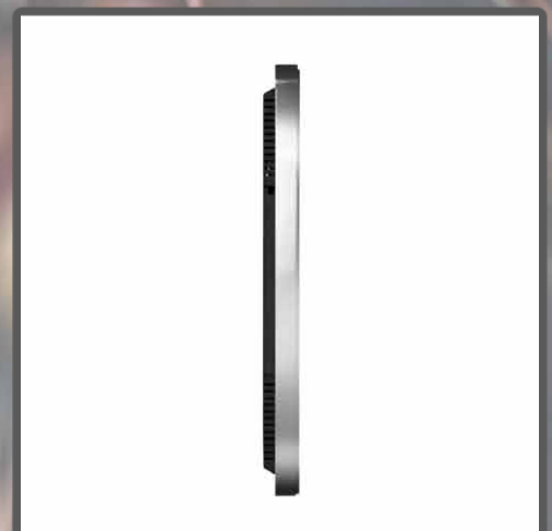
22" Slimline Digital Advertising Display